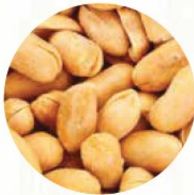
Roasted & Salted Peanuts No. WSC279