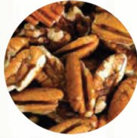
Natural Large Pecan Pieces No. 17987