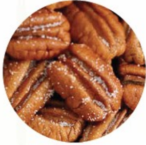
Roasted & Salted Pecans No. WSC539