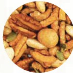
Back Country Snack Mix No. WSC544