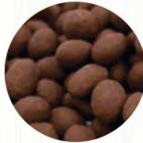
Milk Chocolate Peanuts No. WSC541