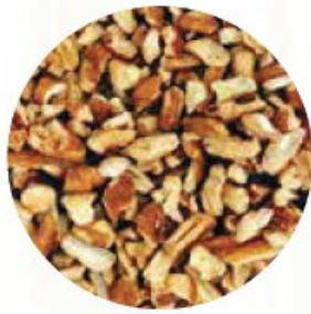
Natural Medium Pecan Pieces No. WSC534