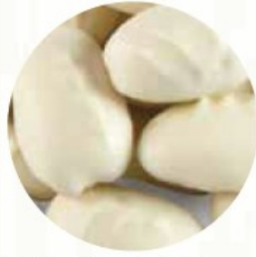
White Chocolate Pecans No. WSC173