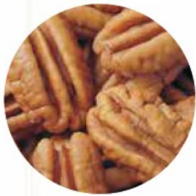
Natural Pecan Halves No. WSC521

NATURAL PECANS ARE HEART-HEALTHY, HIGH IN ANTIOXIDANTS & KETO FRIENDLY!