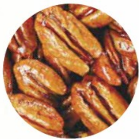
Honey Glazed Pecans No. WSC537