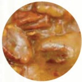
A. Pecan Brittle WSC536