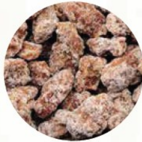
Praline Pecans No. WSC550