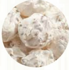
Pecan Divinity No. 17991