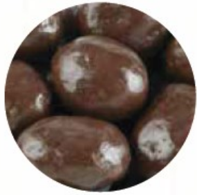
Milk Chocolate Pecans No. WSC548