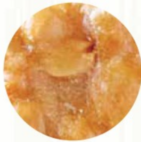
B. Peanut Brittle WSC543