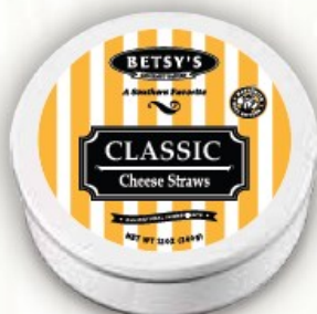
Classic Cheese Straws No. 15346